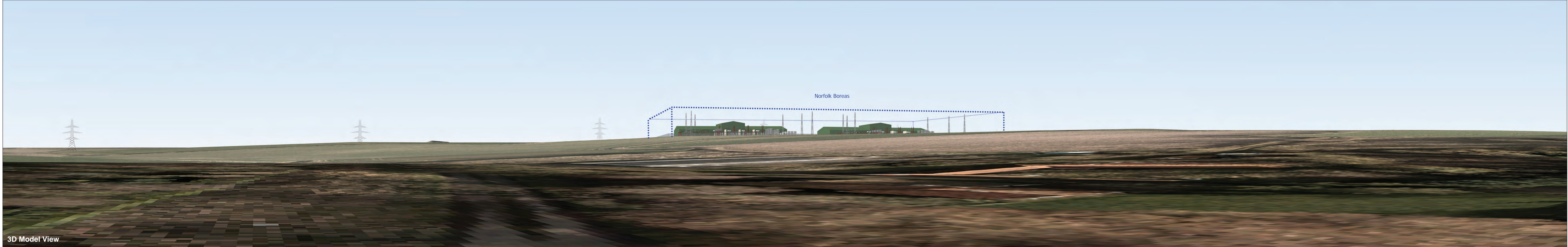
3D Model View

OS reference: 589735 E 309502 N Horizontal field of view: 90° (cylindrical projection) Camera: Canon EOS 5D Mark II Eye level: 51.5m AOD Principal viewing distance: 522 mm Lens: 50mm (Canon EF 50mm f/1.4) Direction of view: 30° Camera height: 1.5 m AGL Nearest substation: 0.83 km Date and time: 25/01/2018, 12:03:51