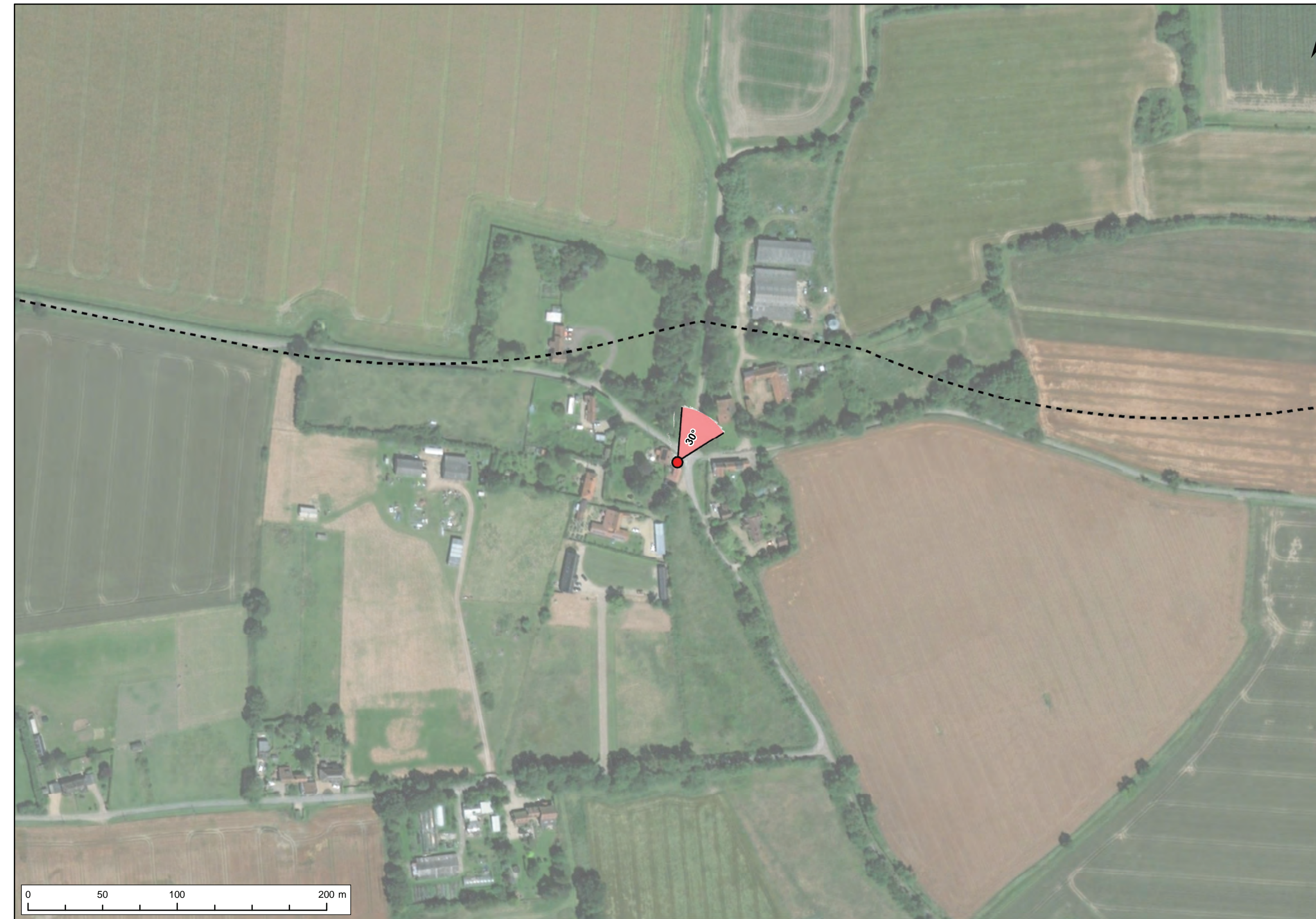
Viewpoint Location Plan (53.5 Degree View) Scale: 1:2,500