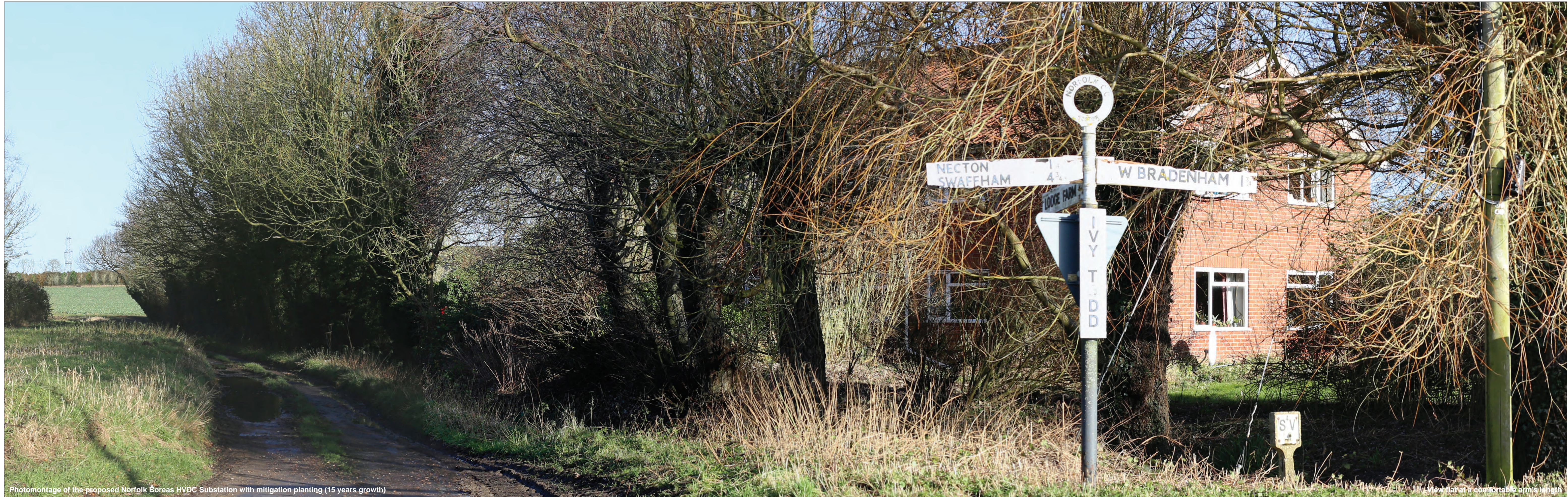
Photomontage of the proposed Norfolk Boreas HVDC Substation with mitigation planting (15 years growth)